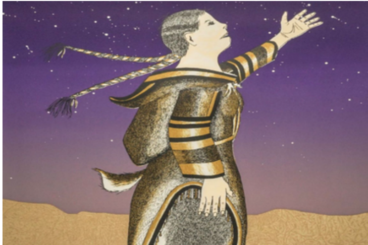
Edglands inspiring us with the indigenous art of the Arctic skies and the Seven Sisters (Pleiades)