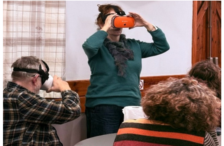
Wild Skies Shetland wowed us with a VR tour of the Northern Lights